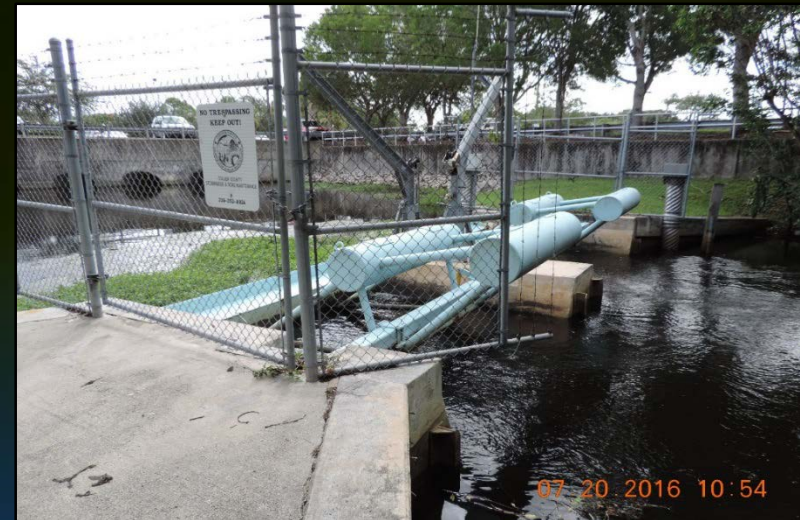
Aging water control structure on Haldeman Creek