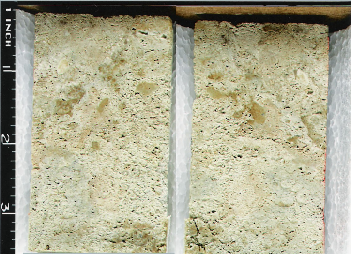
Bottom 6.0 to 6.5 ft.