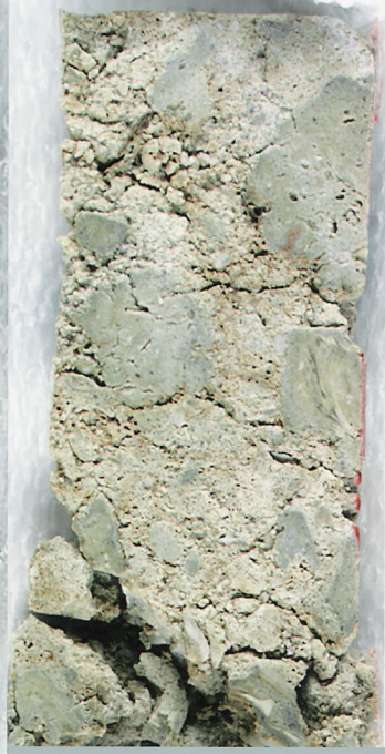
Bottom 10.5 to 11.0 ft.