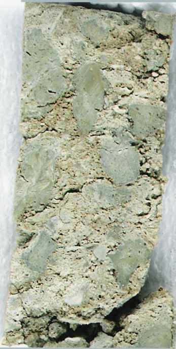
Bottom 10.5 to 11.0 ft.