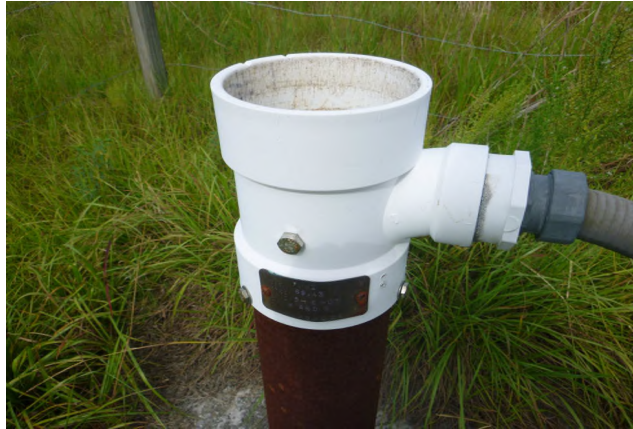
Date of photo: 7/15/2015