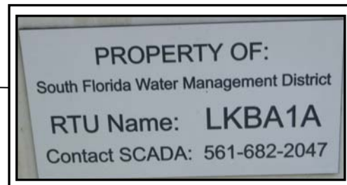
Benchmark Close Up